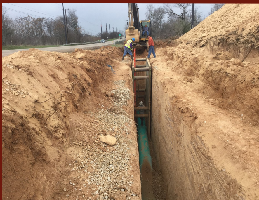
Capital Improvement Project 24 inch sewer line on FM 471