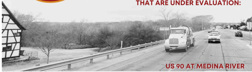
US 90 AT MEDINA RIVER

THERE ARE TWO BRIDGES IN CASTROVILLE THAT ARE UNDER EVALUATION: